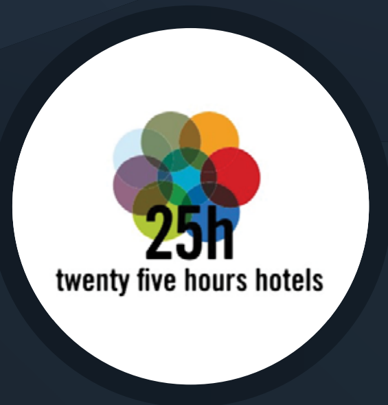
TWENTY FIVE HOURS HOTELS