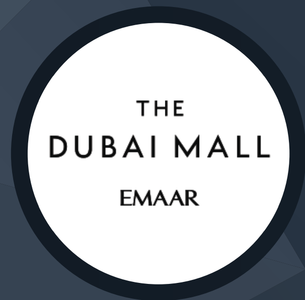
EMAAR | THE DUBAI MALL