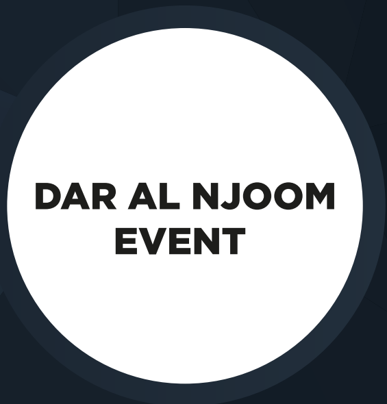
DAR AL NJOOM EVENT