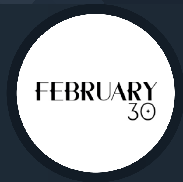
FEBRUARY 30 BEACH CLUB