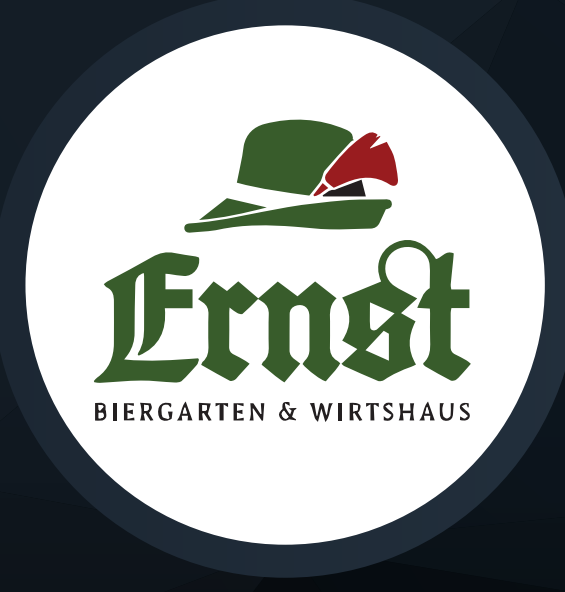
ERNST BIERGARTEN & WIRTSHAUS