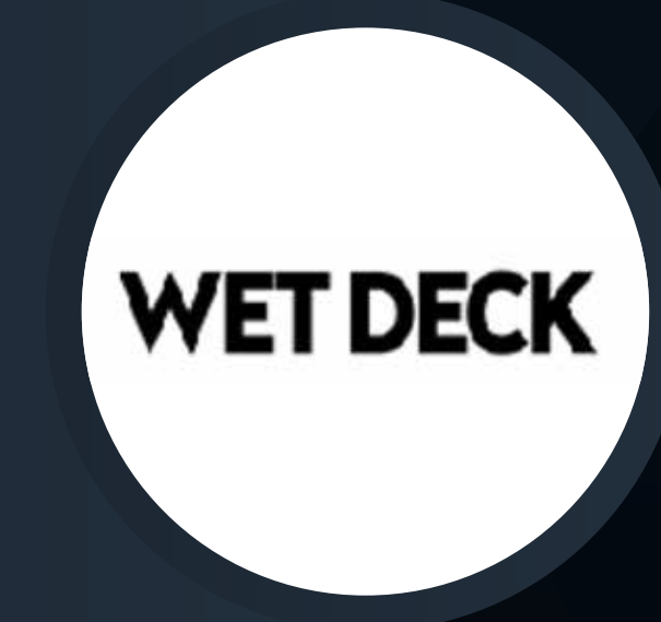
WET DECK BEACH CLUB