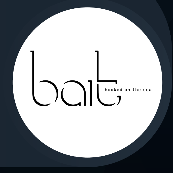
BAIT HOOKED ON THE SEA