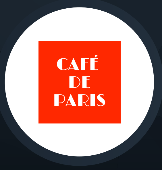
CAFÉ DE PARIS