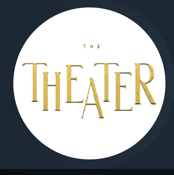
THE THEATER DUBAI