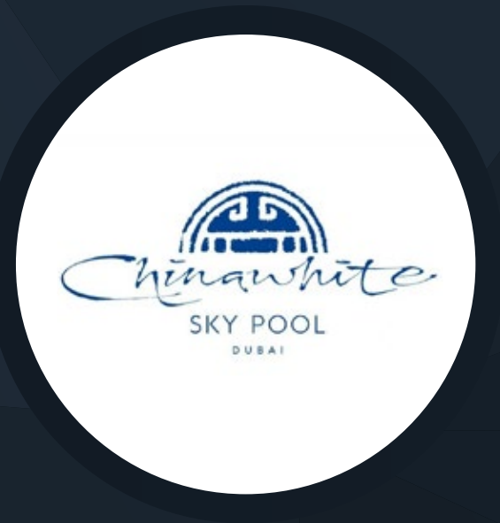
CHINAWHITE SKY POOL DUBAI