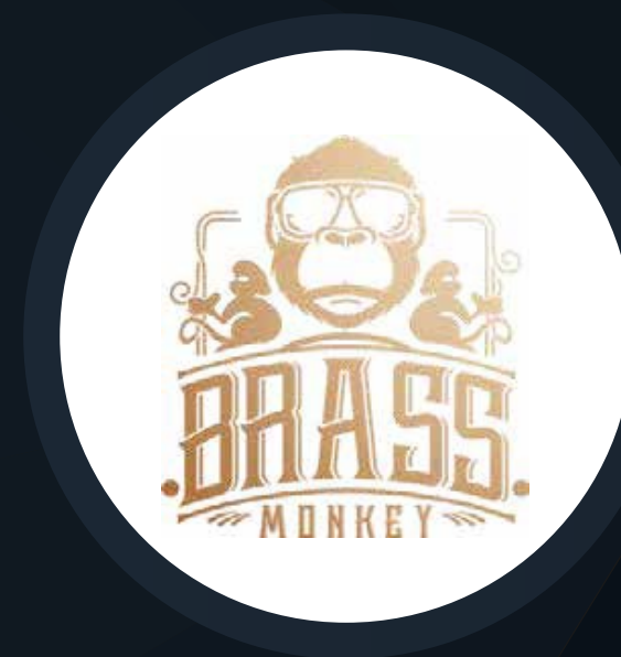
BRASS MONKEY BLUEWATERS ISLAND & CITYWALK