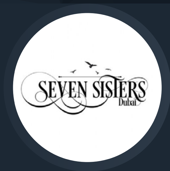
SEVEN SISTERS DUBAI