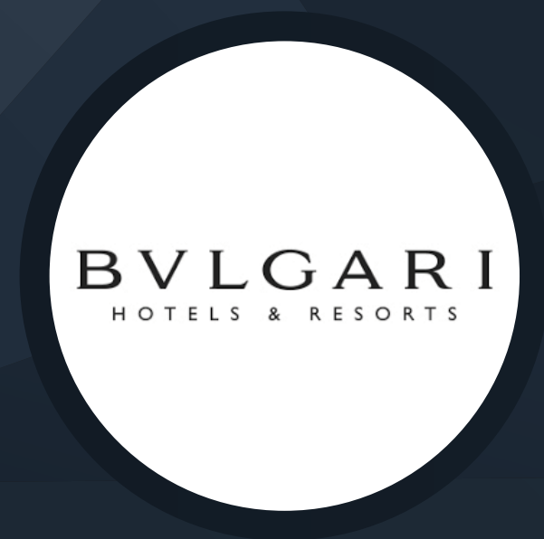
BVLGARI HOTELS & RESORTS