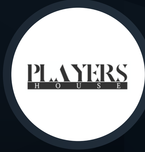
PLAYERS HOUSE LOUNGE & SPORTS CLUB