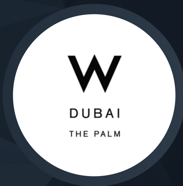
W THE PALM