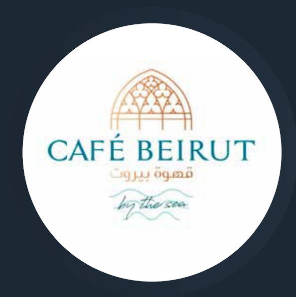
CAFE BEIRUT BY THE SEA