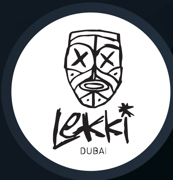
LEKKI CLUB DUBAI