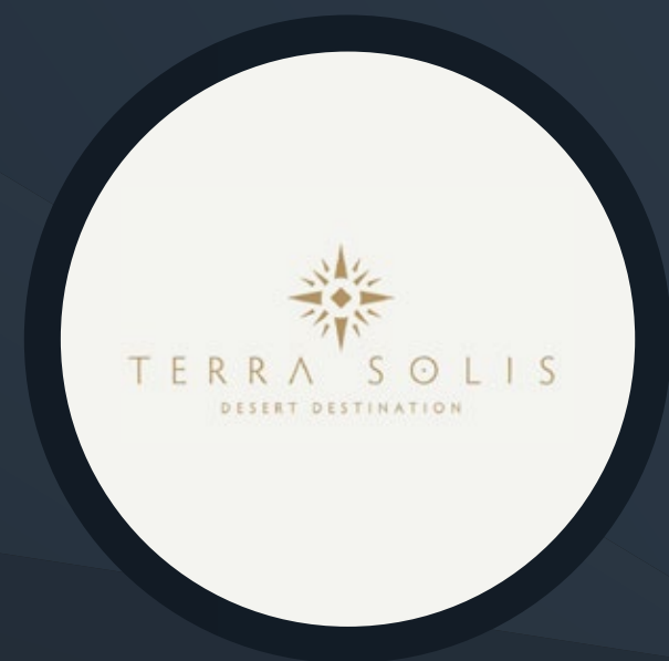
TERRA SOLIS DESSERT DESTINATION