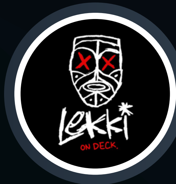
LEKKI ON DECK DUBAI