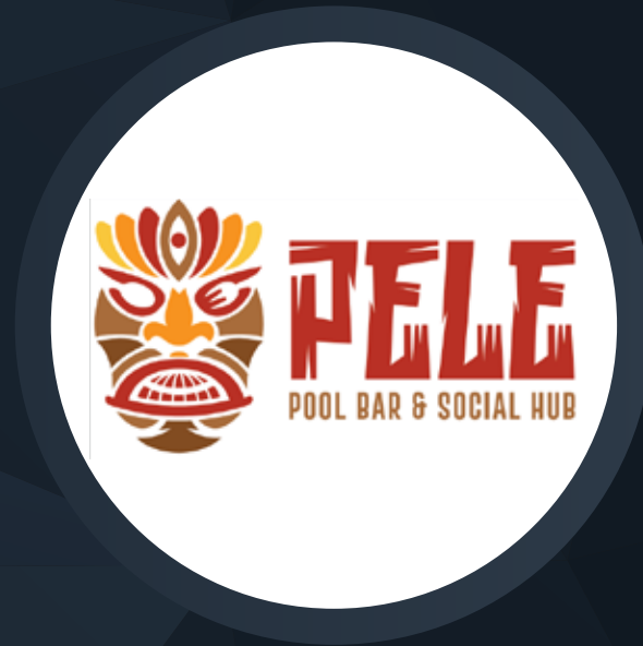
MISSISSIPPI SOCIAL HUB