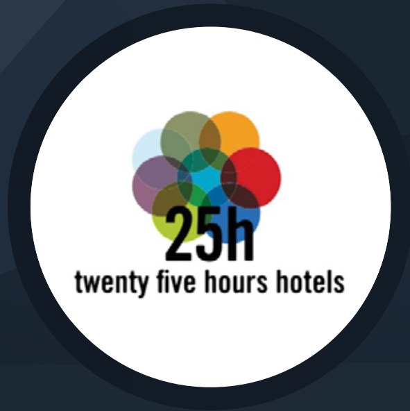
TWENTY FIVE HOURS HOTELS