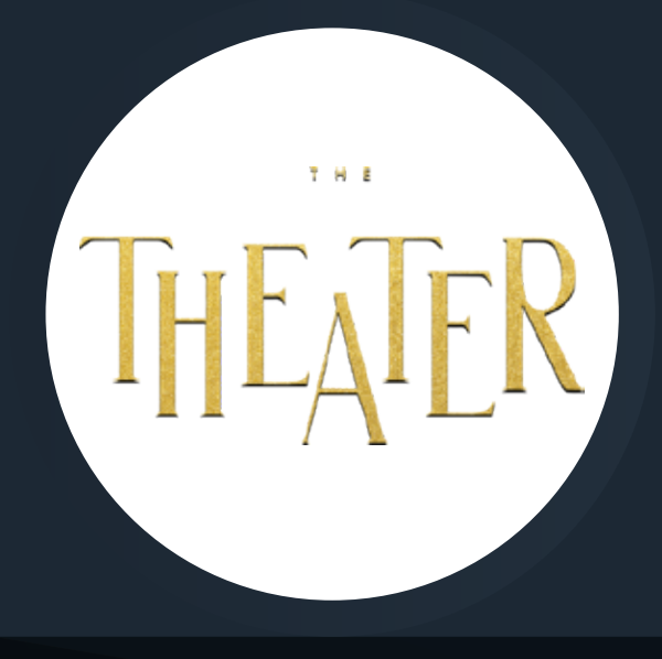
THE THEATER DUBAI