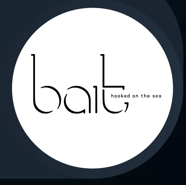
BAIT HOOKED ON THE SEA