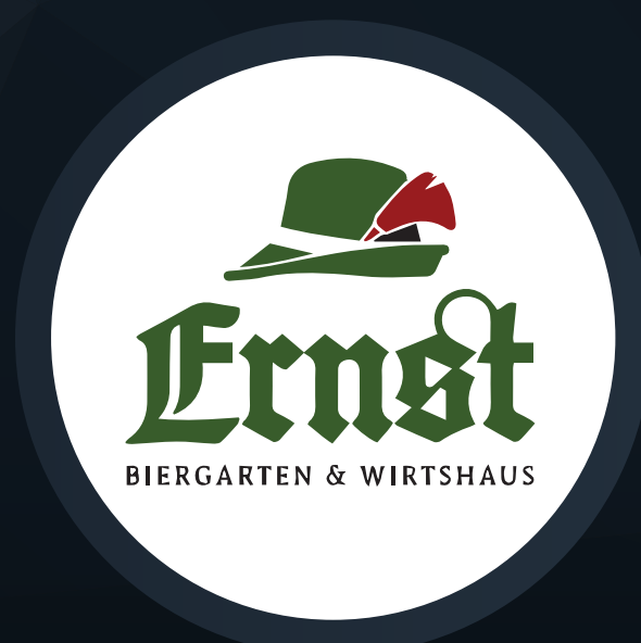
ERNST BIERGARTEN & WIRTSHAUS