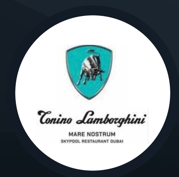
MARE NOSTRUM | CHICHETTI POOL BAR