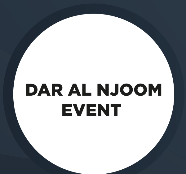
DAR AL NJOOM EVENT