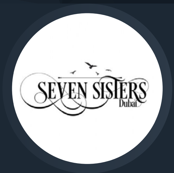
SEVEN SISTERS DUBAI